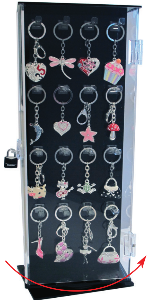
Rotating Display "D-32 "

Free!!! "D-60" with 240 pcs. or Qualifying order!