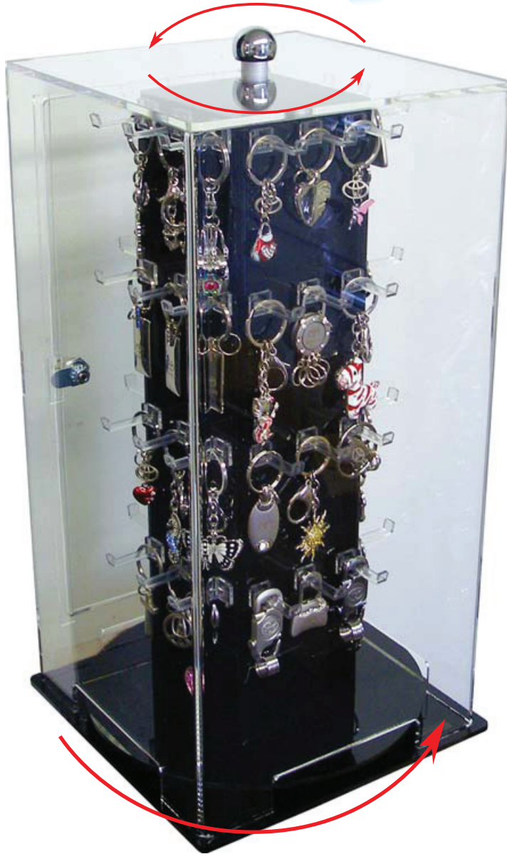
Stationary Display "D-60 "

Free!!! "D-60" with 240 pcs. or Qualifying order!