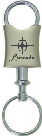
LNKPW-B 1950'S CLASSIC