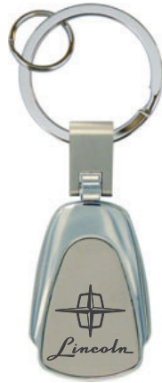
LNKSP-B 1950'S CLASSIC